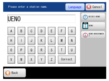
Screen for selecting stations by entering station names

Passengers will be able to select a destination for ticket purchase by entering the name of the station in Roman characters. When the first character is entered, a list of candidate stations appears. Entering further characters further narrows down the list of candidate stations.