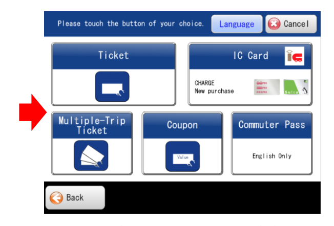
Purchase screen in English