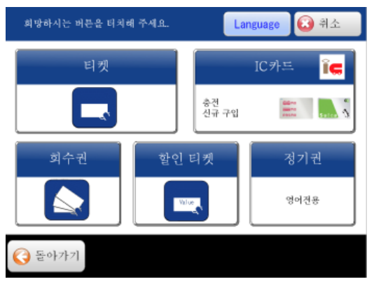
Purchase screen in Korean