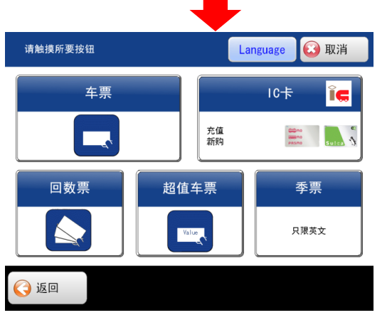
Purchase screen in Chinese (simplified)