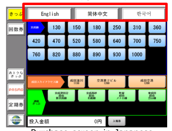
Purchase screen in Japanese (Addition of language selection buttons)

An overview of the upgrades is provided below.