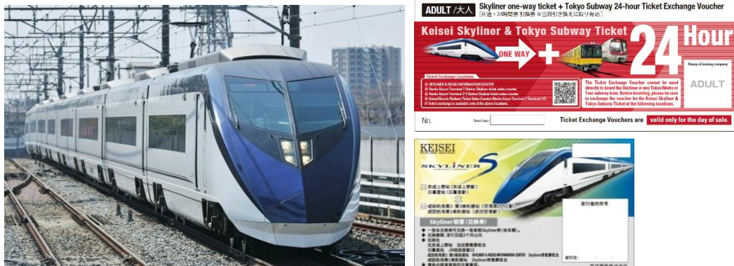
Left Photograph: Keisei Skyliner Upper Right Photograph: Keisei Skyliner & Tokyo Subway Ticket (Exchange Ticket) Image Lower Right Photograph: Skyliner Coupon (Exchange Ticket) Image

The details of the expanded network of sales outlets of the “Skyliner Coupon” and “Keisei Skyliner & Tokyo Subway Ticket” are on the next page.