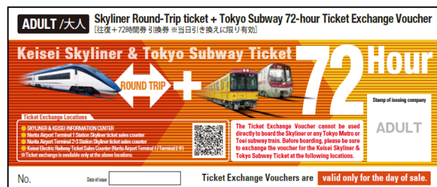
Left Photograph: Skyliner