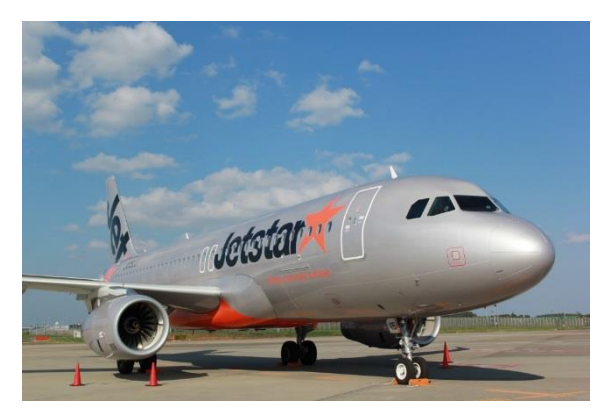
Left: the Skyliner, Right: a Jetstar Japan aircraft