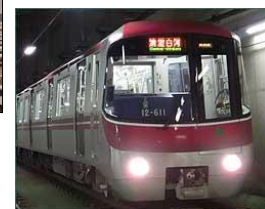
The Tokyo subway network travels to numerous tourist spots (Pictured: Tokyo Metro Ginza Line and Toei Oedo Line)