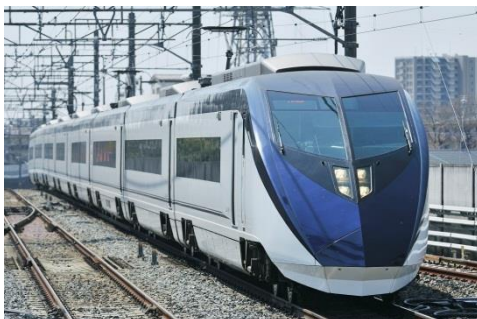
The Skyliner connects Narita Airport and central Tokyo in as fast as just 36 minutes

Details concerning the expansion of sales locations for the “Keisei Skyliner & Tokyo Subway Ticket” are as shown on the following page.