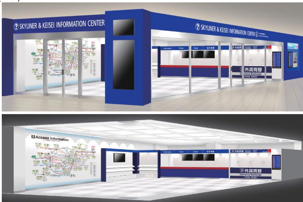
Top Photograph: Exterior Image / Bottom Photograph: Interior Image