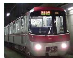
Left Photograph: Skyliner Upper Right Photograph: Keisei Skyliner & Tokyo Subway Ticket (Exchange Voucher) Image Lower Right Photograph: Tokyo Metro Ginza Line, Toei Subway Oedo Line