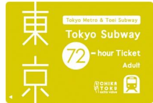
Tokyo Subway Ticket (Image)

From left: 24 hours, 48 hours and 72 hours (All adult tickets)