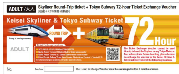
Left Photograph: Skyliner