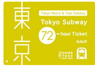
Tokyo Subway Ticket (Image)