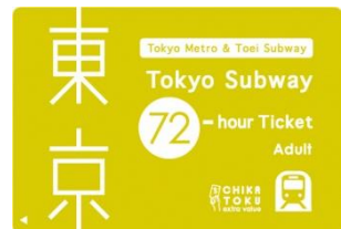
Tokyo Subway Ticket (Image)

From left: 24 hours, 48 hours and 72 hours (All adult tickets)