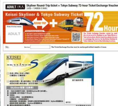
Left Photograph: Keise Skyliner