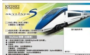
Left Photograph: Keisei Skyliner