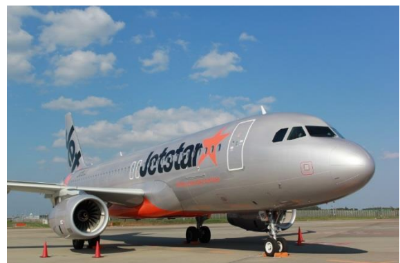
Left: the Skyliner, Right: a Jetstar Japan aircraft