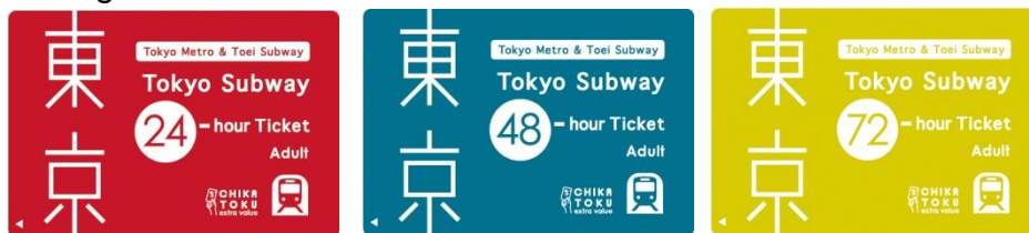
Tokyo Subway Ticket (example)

From left: 24-hour, 48-hour, and 72-hour (all adult tickets)