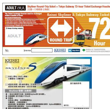
Left Photograph: Skyliner