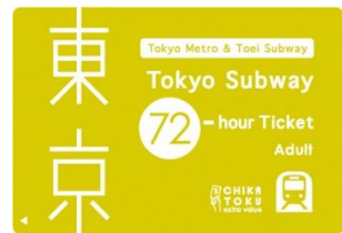
Tokyo Subway Ticket (Image)