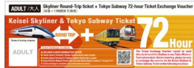
Keisei Skyliner & Tokyo Subway Ticket (Exchange Ticket) Image