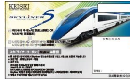
Skyliner Coupon (Exchange Ticket) Image